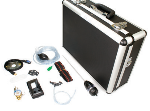
Deluxe Confined Space Kit MC-CK-DL

Order detector and calibration gas separately.