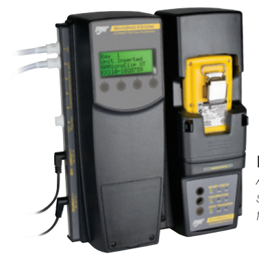
MicroDock II Automatic test and calibration station (see MicroDock II section for additional information)