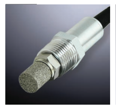
for insertion into pipes (max 200 psi).