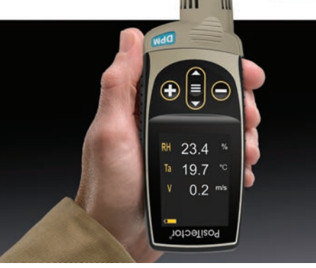
PosiTector DPM A shown with NEW Auto rotating display with Flip Lock.

Hot-wire anemometer with your choice of wind speed measurement units — m/s, km/h, mph, ft/s, ft/m, knots. DPM A models only.