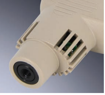
PosiTector DPM D includes 1/2" NPT threads PosiTector DPM IR probe includes a noncontact infrared surface temperature sensor.