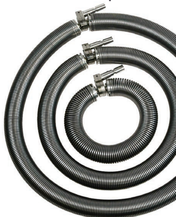
Rolling Spring Electrodes

For a complete list of available electrodes visit www.defelsko.com/hhd