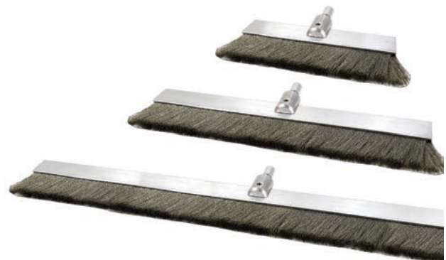
Flat Wire Brush Electrodes