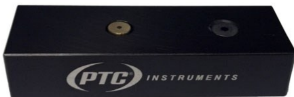
Aluminum Test Block

Other durometer types, custom models and durometers from other manufacturers can also be certified by PTC Metrology™.