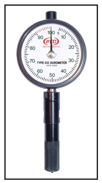
Model 203 Pencil Style Analog ASTM Type OO Durometer

The durometer's redesigned 1/2" diameter base is the smallest base permitted by ASTM D2240 Specifications. This allows it to be used in confined or hard to reach areas other durometers cannot test. A knurled surface gives a more secure grip when making hand held readings. These durometers meet or exceed all aspects of ASTM D2240.