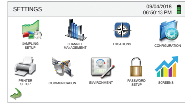
Icon Driven Menus for Ease-of-Use