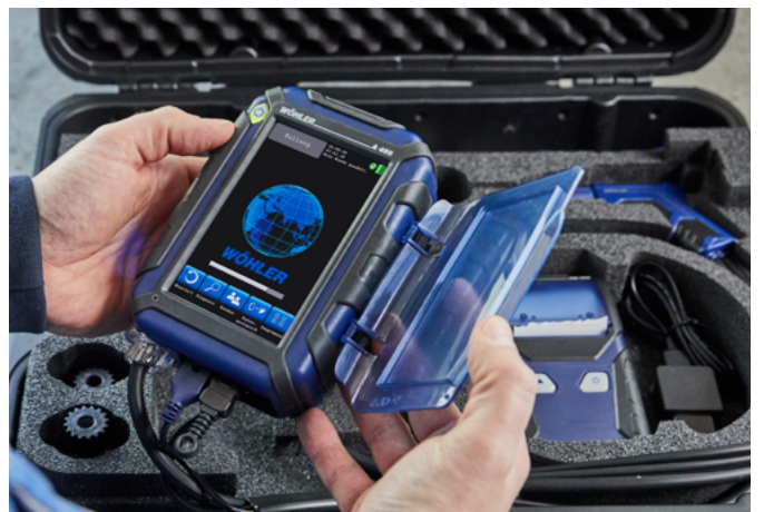
Sturdy and enclosed in a case.