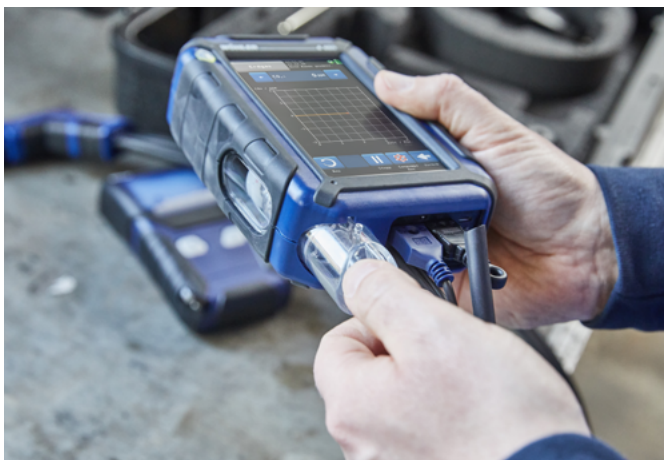
Easy access to condensate trap and filters.