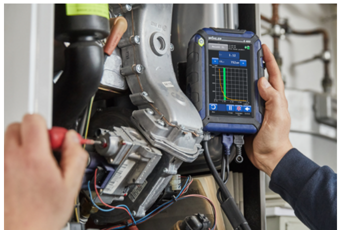
The tuning guide offers an advanced guidance to properly adjust the burner.