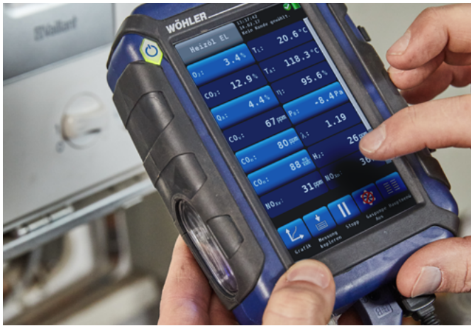
All measured values available at a glance with high-resolution display.