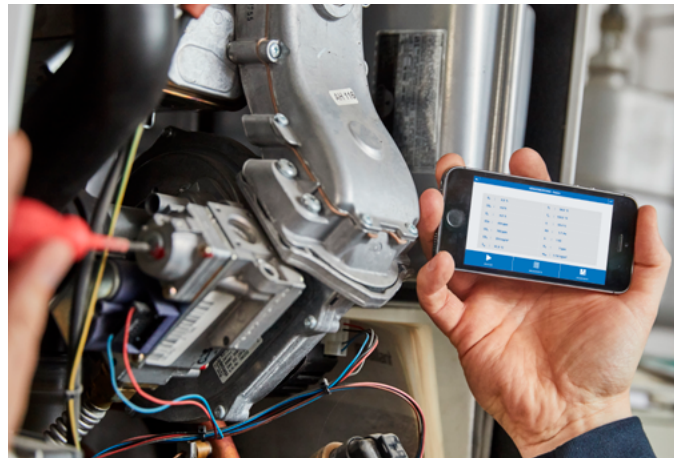
Wöhler A 450 app: Displaying the measured data on a mobile device.