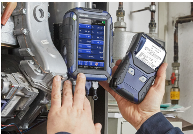
Printout of the measured data on site.